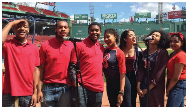
West End House singers warm up before their debut at Fenway Park.

Special thanks to U.S. Pavement Services, which made this opportunity available to West End House youth through their partnership with the Red Sox.